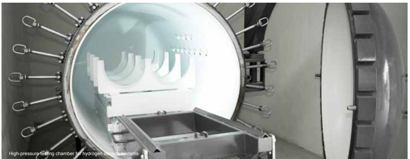
High-pressure testing chamber for hydrogen storage systems